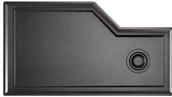
Sink Diade Gun Metal 3028 856